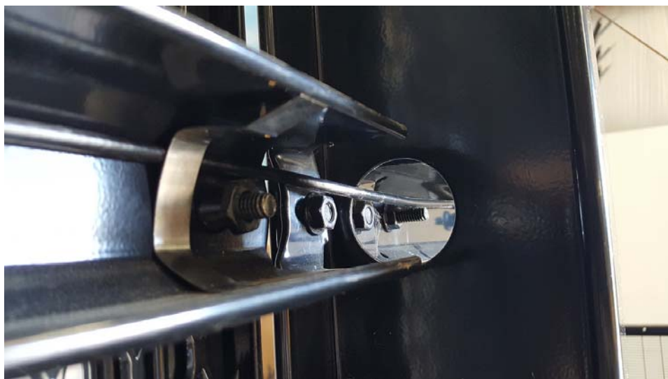
Figure 3 – Cable Through Post