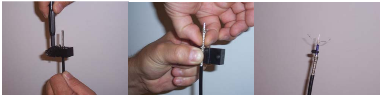
Figure 1: Preparing the MicroPoint Cable Ends

With an ohmmeter, check the resistance between the shield and each of the three remaining conductors. The resistance should be greater than six megohms. A measurement of less than 100 ohms indicates a short between the conductors - check the other end of the Sensor Cable and insure the wires are not shorted. A measurement between 100 ohms and six megohms indicates that water has entered the cable. This MUST be replaced with new cable. When the cable has been checked, leave the cable as is and begin to unreel.