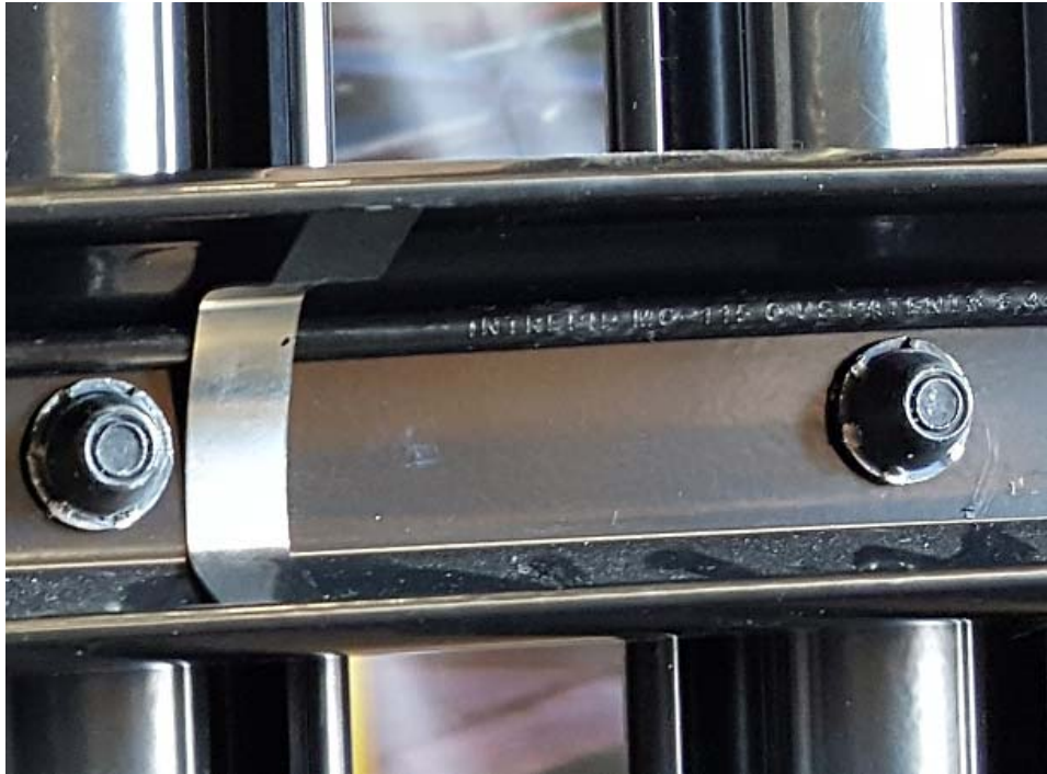
Figure 2 - Cable Clipped into Rail

The clips (Ameristar Part #SWC100) must be placed perpendicular to the MicroPoint Cable . The clips should be placed every nine (9) inches and the sensor cable should be placed at the upper back part of the clip. Check the rails and post-hole intersections for protrusions that may damage the cable.